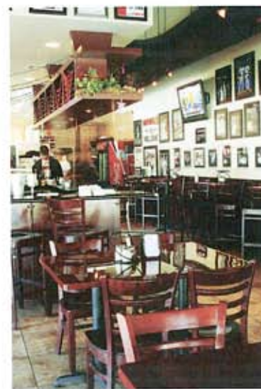
TRENDY PIZZERIAS ON THE GOLD COAST SPECIALIZE IN A STYLE OF WOOD-FIRED PIES PIONEERED BY ITALIAN IMMIGRANTS IN NEW YORK IN THE LATE 19TH CENTURY

A new breed of upscale pizza places proves that the good pies sell, regardless of price.