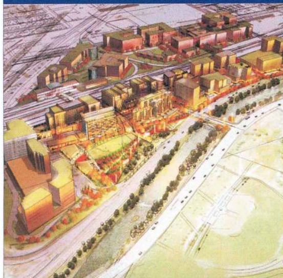
Metropolitan Gardens - Denver, Colorado

WE'RE JOSEPH FREED GET TO KNOW US BETTER