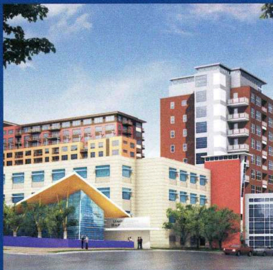
Hilldale, Phase 2 - Madison, Wisconsin

A crowning achievement in imaginative restoration, the totally redeveloped Hilldale has become Madison's newest and most sought-after destination for the nation's leading retailers. Moving into the final phase, Hilldale will be transformed into a multi-faceted, 24-hour environment, specifically designed to mirror the distinct personality and lifestyle of one of the Midwest's most dynamic communities. We're building for future generations to live, work and shop. Take another look at Joseph Freed.