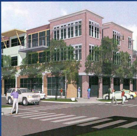
Willits - Basalt, Colorado

A multi-functional city within the city, transformed from industry and history, to real city living, Metropolitan Gardens is our most aggressive new development, the largest of its kind in North America. To the west, just down the road from Aspen and Snowmass, is Willits, a traditional downtown with tree-lined streets, on-street parking, ground floor retail with residential lofts above and state-of-the-art office space, all nestled in a magnificent glacial valley.