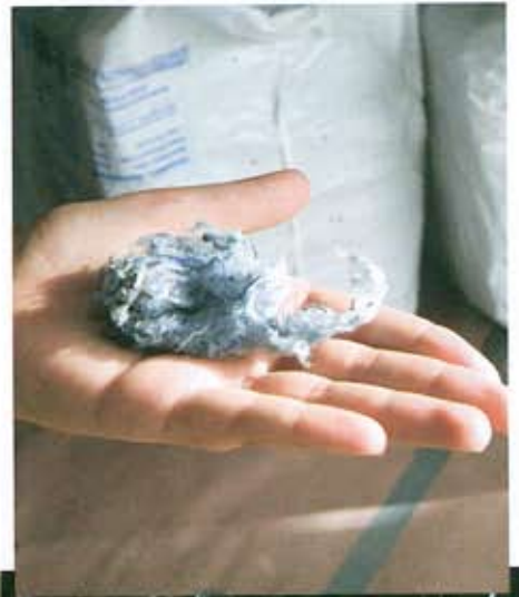
The product of recycled blue jeans: Ultratouch—a highly effective insulator

Short for Leadership in Energy and Environment Design and developed eight years ago, the LEED process determines just how environmentally friendly green buildings really are. Included are commercial and neighborhood developments, as well as schools.