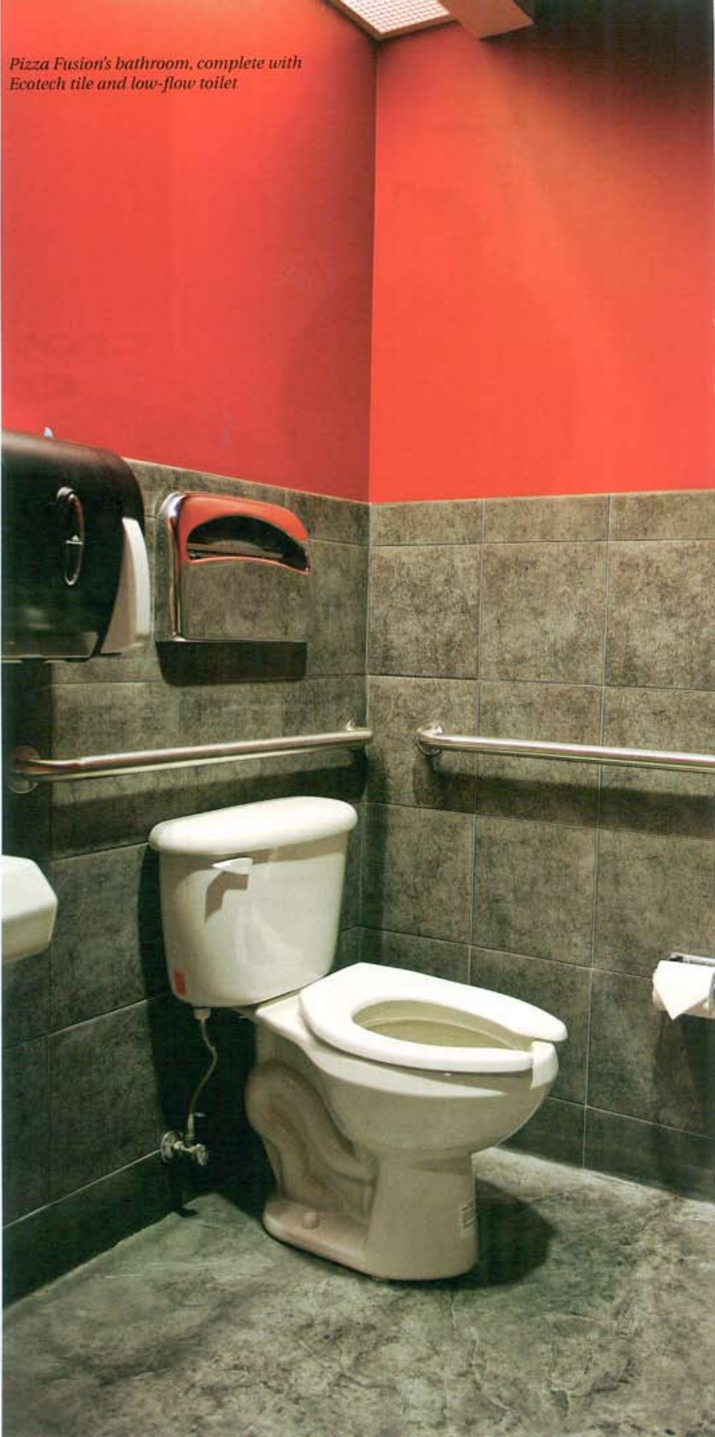
Pizza Fusion's bathroom, complete with Ecotech tile and low-flow toilet

Fletcher Burton, the Arroyo Grande contractor Borene hired for the six-week build, shares Borene's LEED vision.