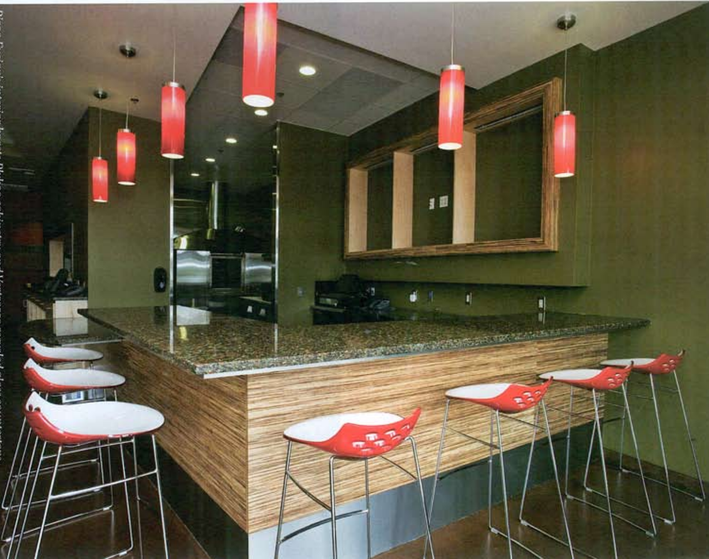
Pizza Fusion's interior boasts Plyboo cabinetry and Vertrazzo recycled glass countertops

"The biggest thing was staying focused," he says. "It's easy to find yourself lost in conversations with people about