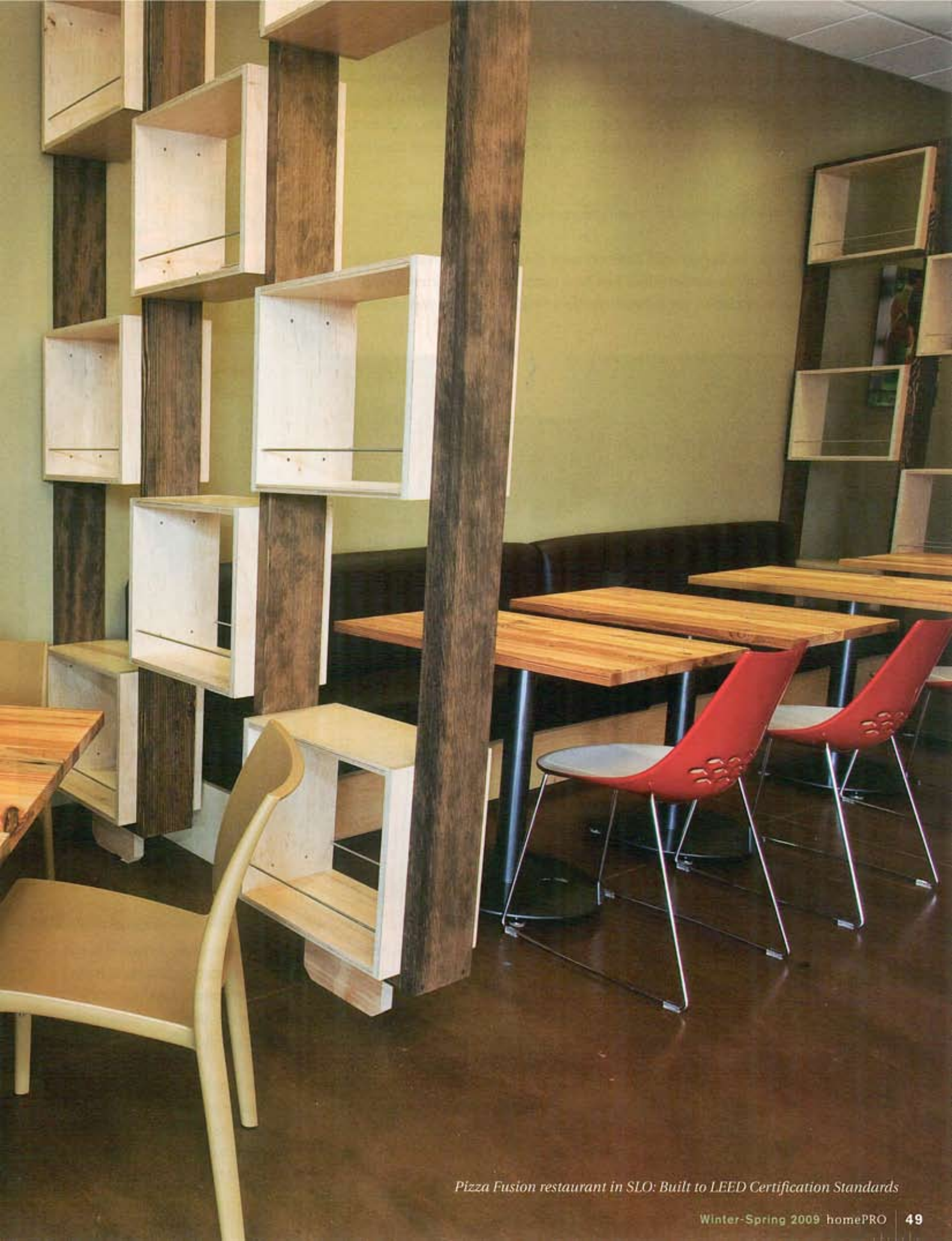
Pizza Fusion restaurant in SLO: Built to LEED Certification Standards